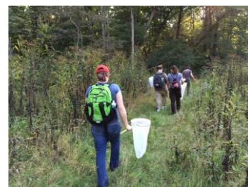
Deep Woods BioBlitz

Columbus graduate students, please be reminded that mailboxes are located in 216 Kottman Hall and should be checked regularly.