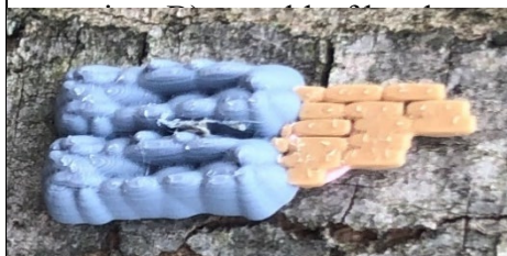
Figure 1. 3D printed models for extension. A) spotted lanternfly egg mass to improve stakeholder

Extension activities focus on improving integrated pest management for agronomic crops. My program engages with OSU Extension Educators, commodity organizations, federal agencies, other university extension specialists and industry. In 2016, I was part of a team that documented resistance in western